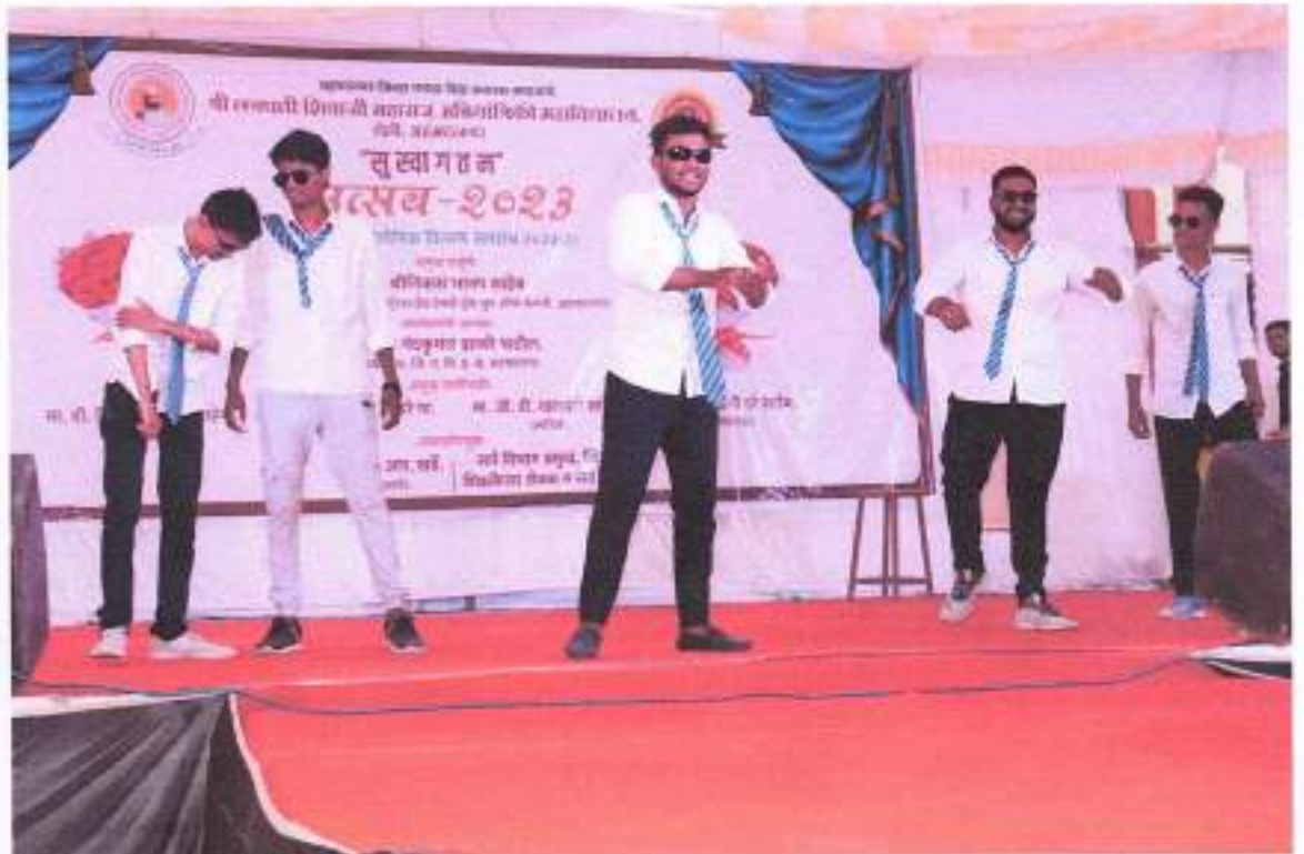
Student performing dance during Cultural Program