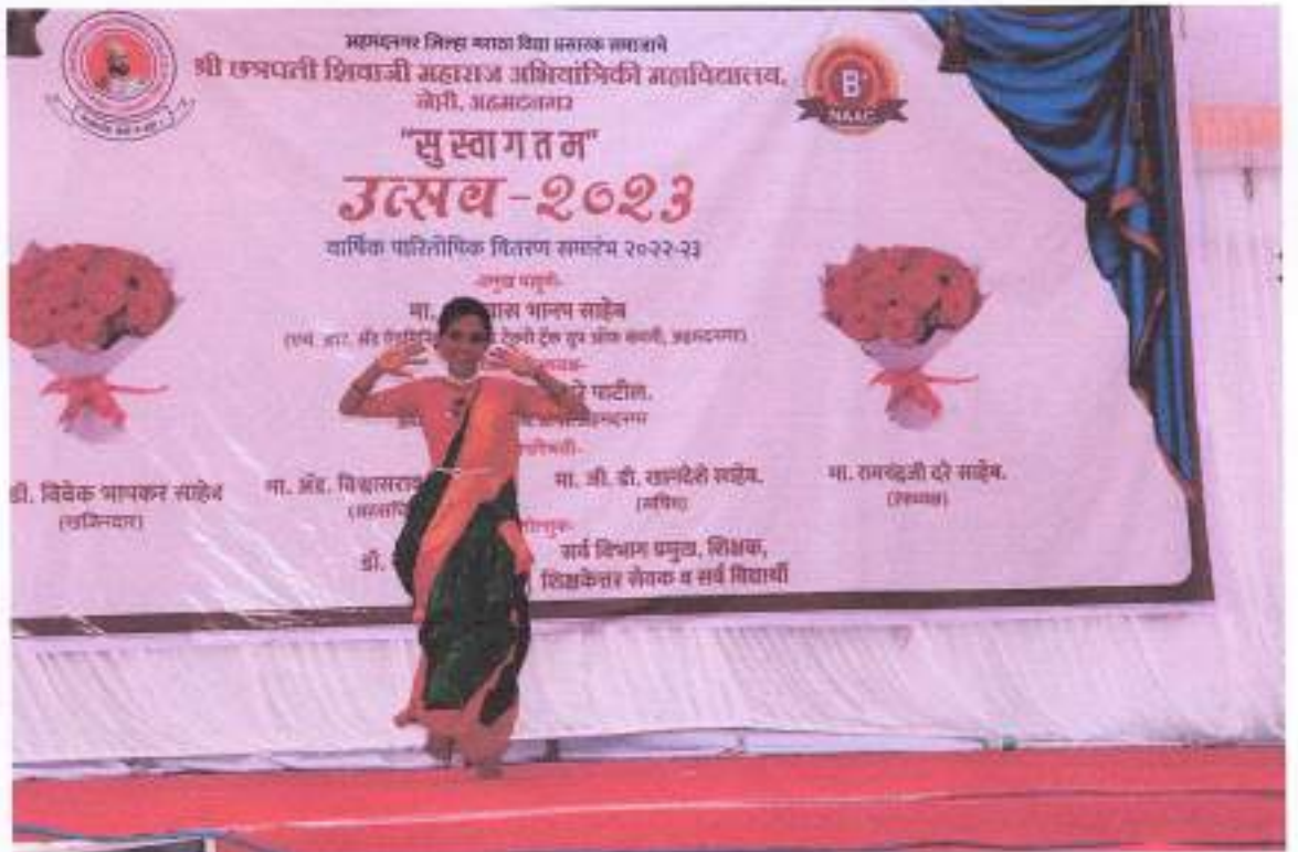
Student performing dance during Cultural Program