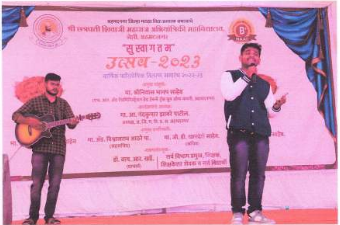
Student performing Singing during Cultural Program